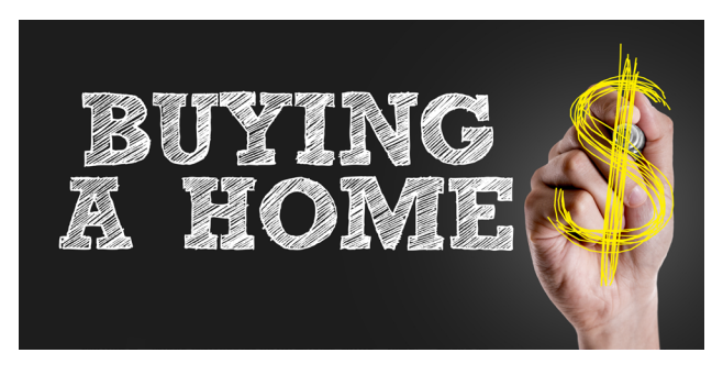
Help all your clients close with confidence. Recommend owner's title insurance from Progressive Title Company .

Owner's title insurance is a policy that protects the homebuyer's property rights for as long as your client or their heirs have an interest in the property. For the same reasons the bank requires a lender's insurance policy, the homebuyer obtains owner's title insurance to protect their legal claims to the property.